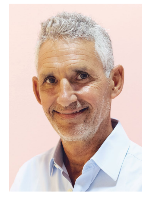
Tim Spector. Credit: Tim Spector

personalized infection advice. We should probably have a personalized risk approach to vaccination, knowing when to get boosters, and selecting the best treatments when someone gets sick. If we start now and use the technology at our disposal, we should be in a much better place for future pandemics.