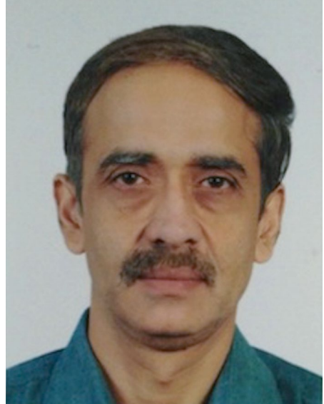
Manoj Murhekar. Credit: Manoj Murhekar

India has a huge population, with about 940 million adults eligible to receive a vaccine against COVID-19. As of September 2021, nearly 70% of the eligible individuals had received one dose and 25% had received both doses. Sustaining the