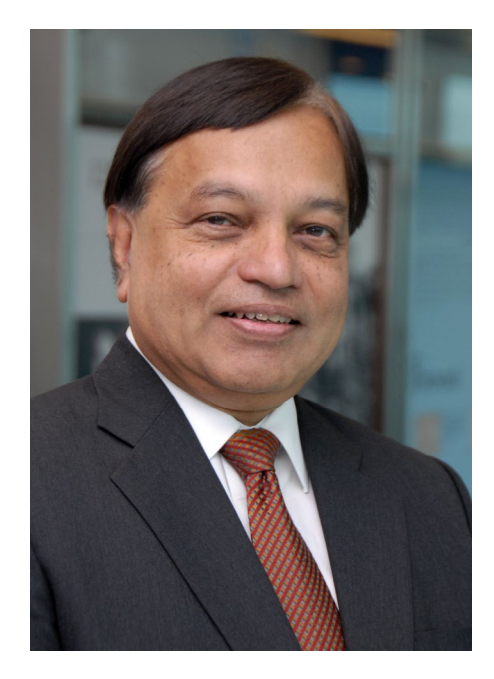
Malik Peiris.

the durability of this impact, and if it differs with the vaccine type and viral variants.